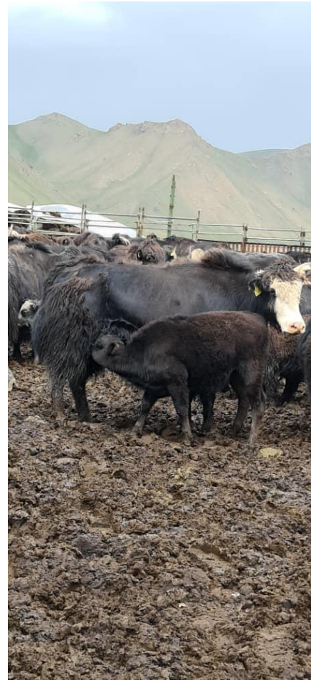
Yak x Galloway