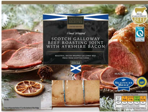
Galloway beef on sale in Aldi