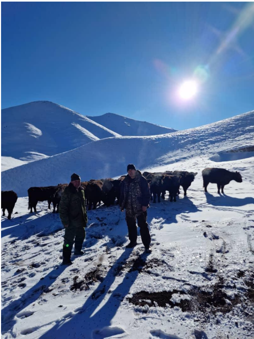
In winter the Galloways get hay